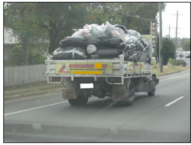
Tipping Fees & Waste Levy - Waste is sometimes transported great distances to save on costs