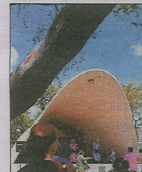
Bigge Day Out at the shell.

Debris from the sound shell will be recycled and the area turfed for public access before more works to revitalise the park start in early 2016.